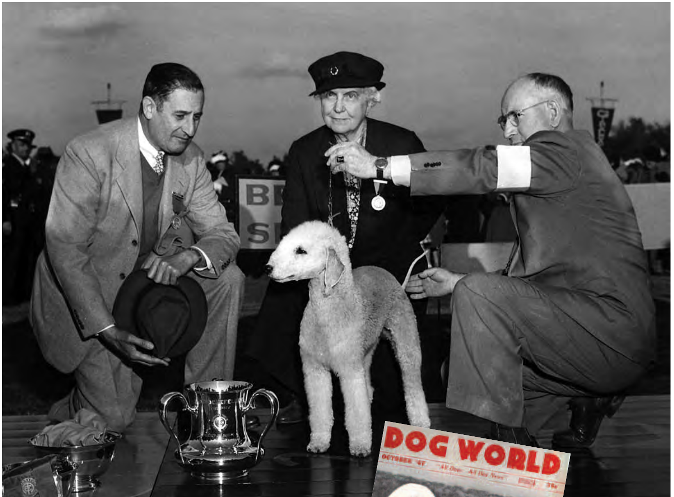
Above: Morris & Essex BIS, 1948— Ch. Rock Ridge Night Rocket. Left: Cover dog Intl. Ch. Canis Prior, 1947.