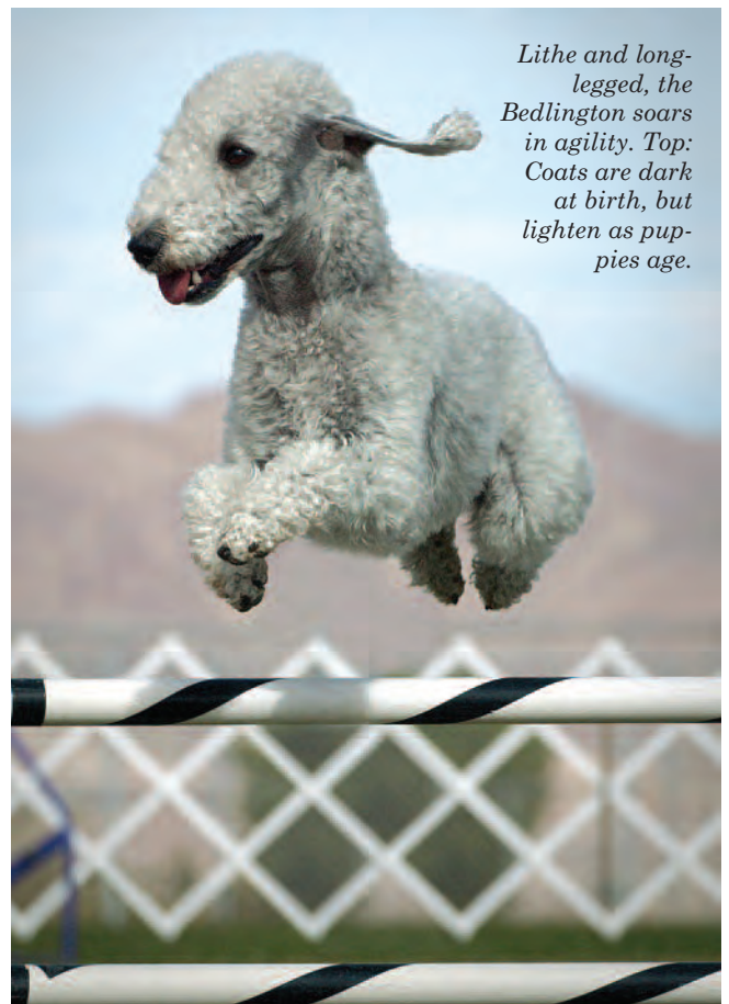
Lithe and long-legged, the Bedlington soars in agility. Top: Coats are dark at birth, but lighten as puppies age.

He contacted a breeder. Then another. And another. Fiercely protective of their dogs, the small group of Bedlington breeders was suspicious of the young man who had no dog experience, no yard, and two kids in a New York City apartment.